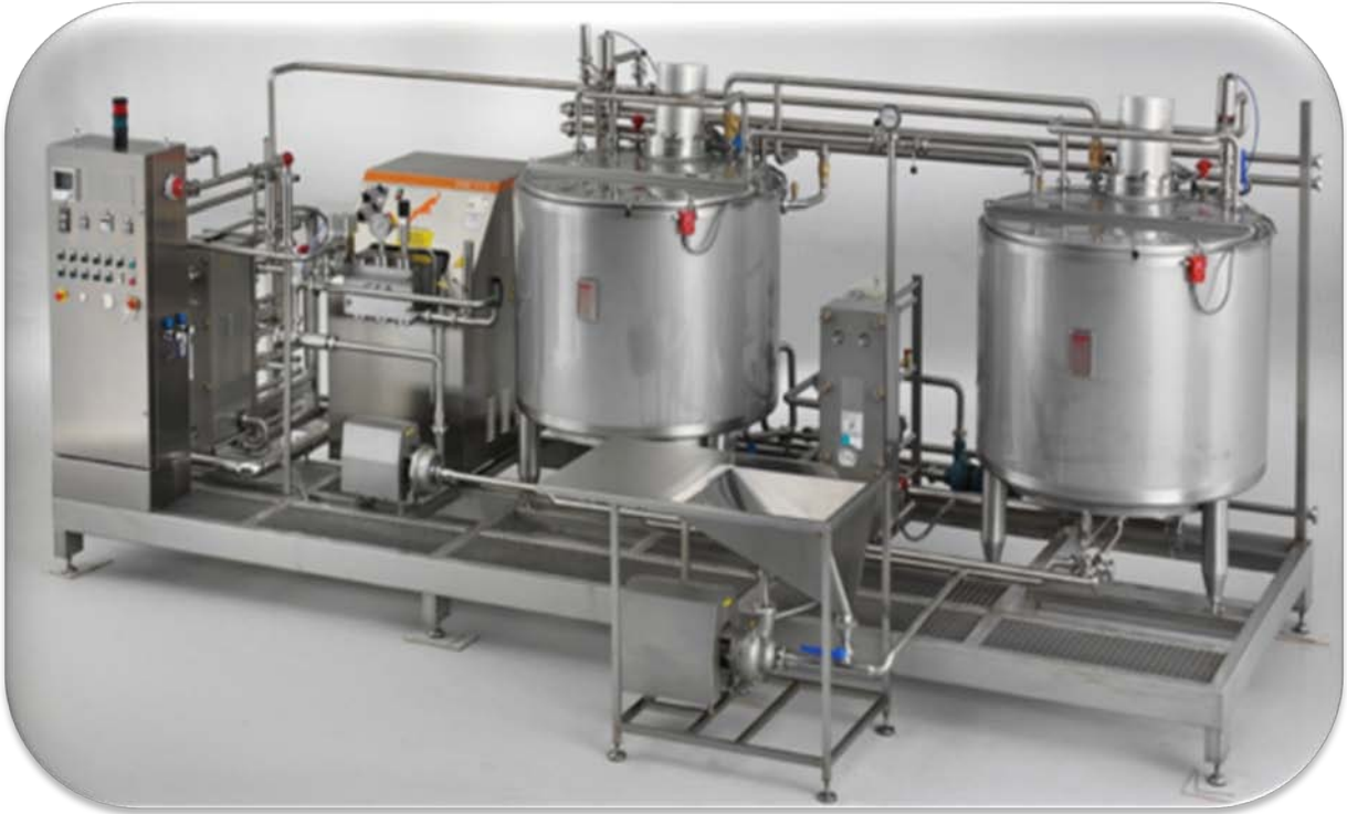
SUGAR SYRUP PLANT