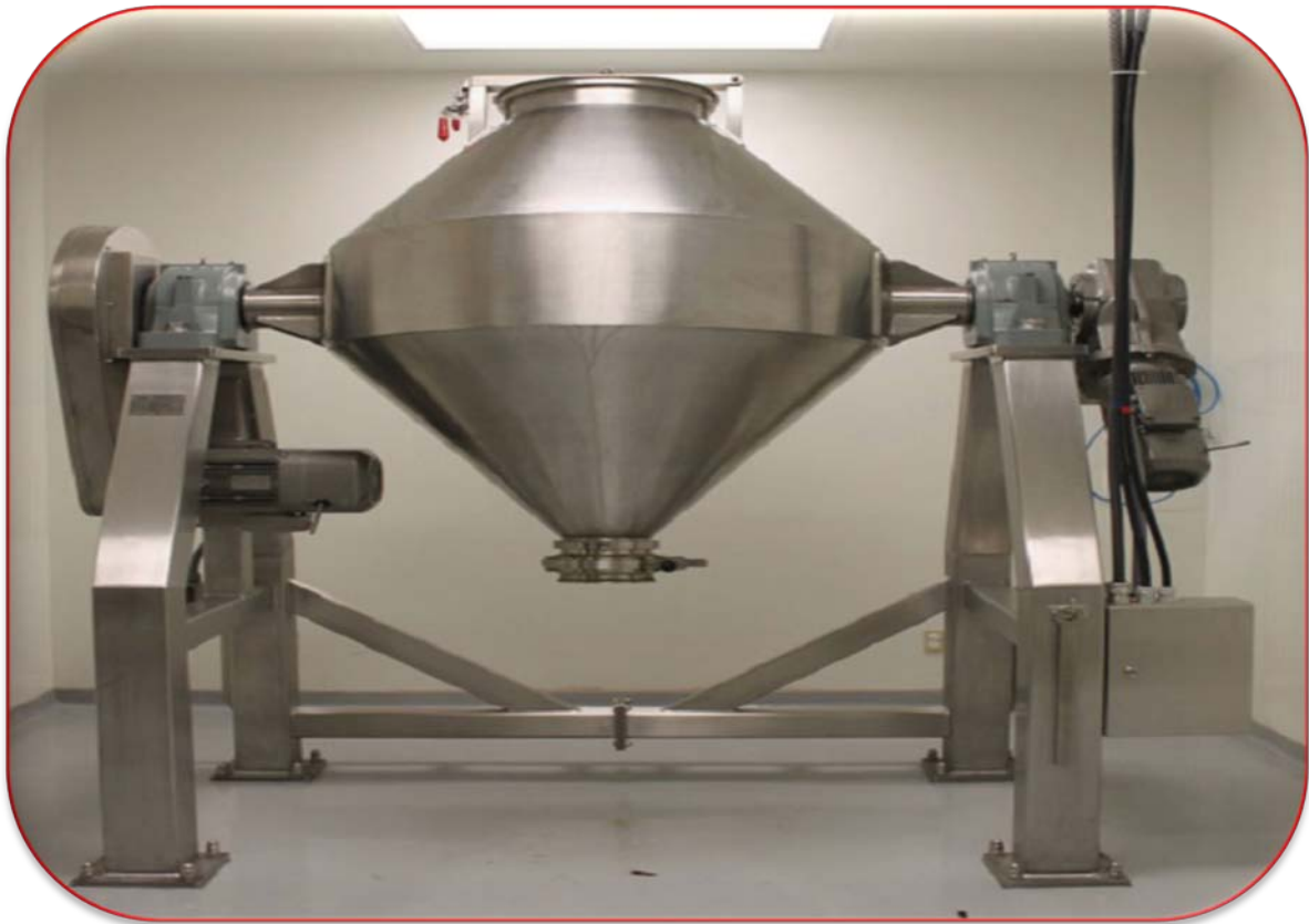
DOUBLE CONE BLENDER