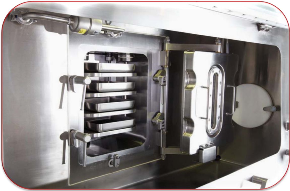
VACUUM TRAY DRYER