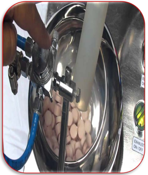
COATING PAN WITH HOT BLOWER