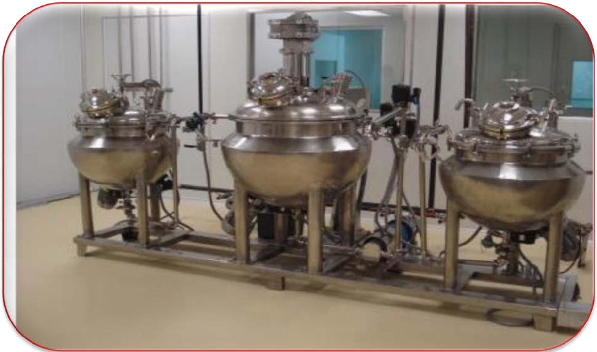
OINTMENT CREAM PLANT