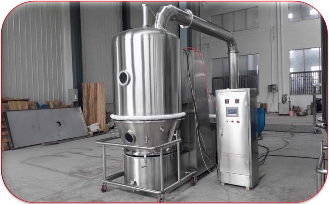
FLUID BED DRYER