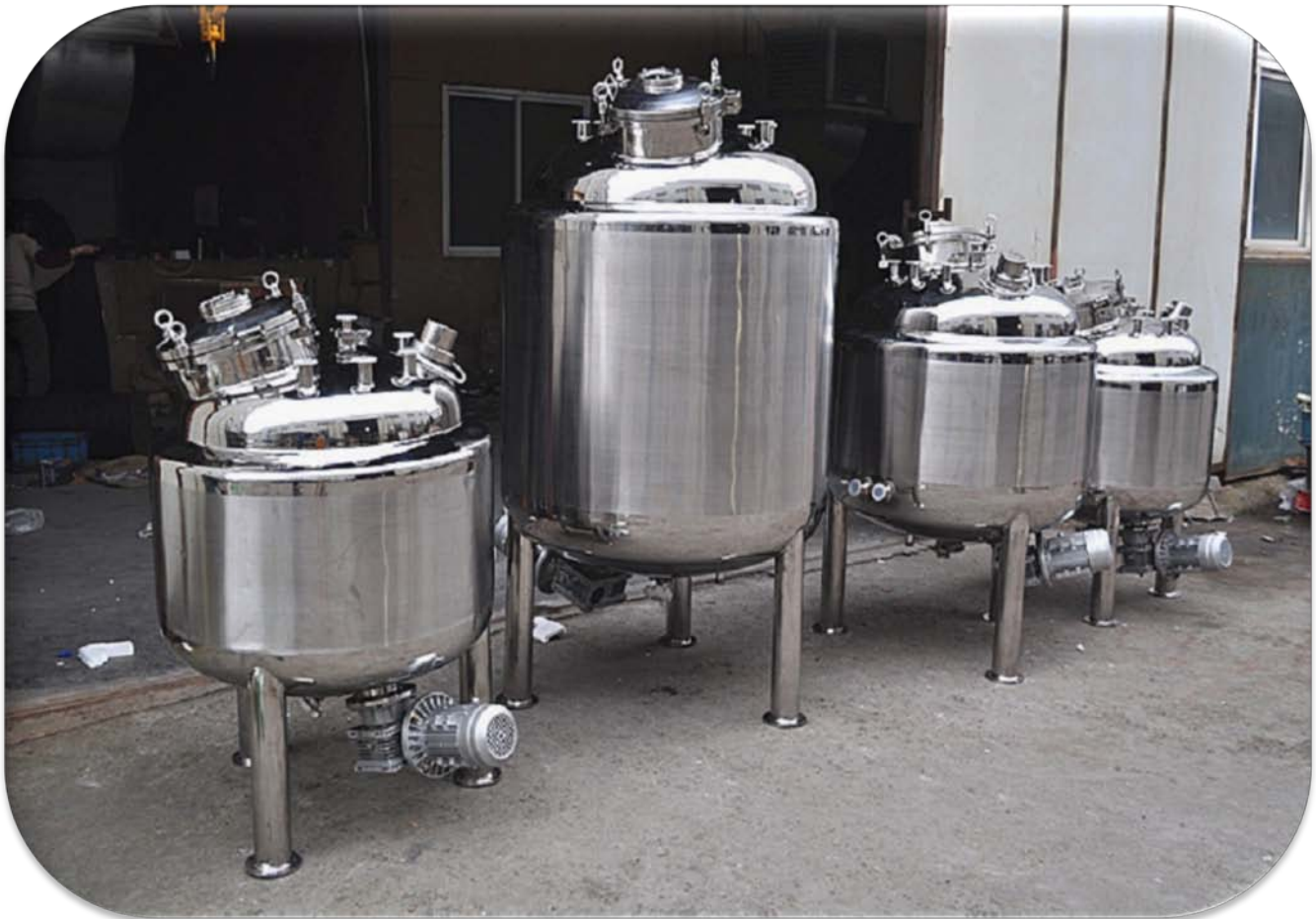
MIXING MANUFACTURING VESSEL