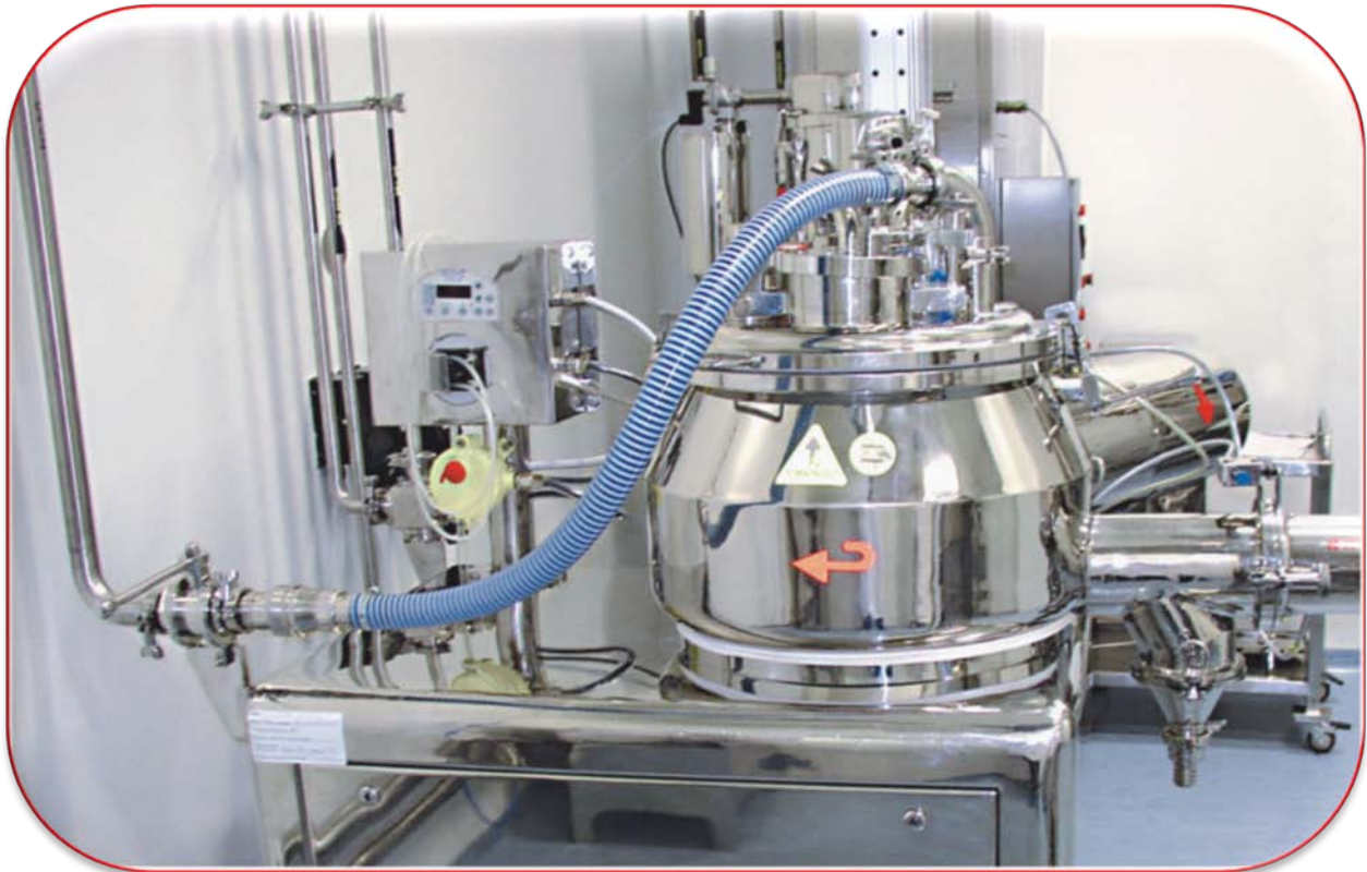
RAPID MIXER GRANULATOR