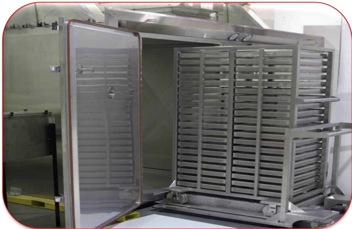
TRAY DRYER OVEN WITH TROLLEY / TRAY